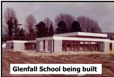
Glenfall School being built

As you know, we have been celebrating our 50th Anniversary this year and last week we held a tea party for staff and governors past and present. It was a great event and lovely to get all of these people together to trawl through archive photographs of the school together and to catch up